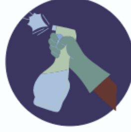
Cleaning & Disinfecting