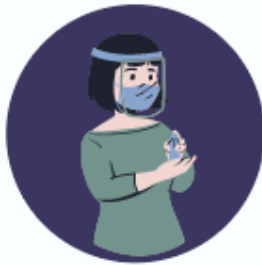
Proper Use of PPE