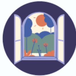
Outdoor Visits are Preferred

Please notify the facility immediately if you develop any symptoms or test positive for COVID-19 or are exposed to someone within 3 Days of your visit. Please call the main line 630-665-6400 ex. 0.