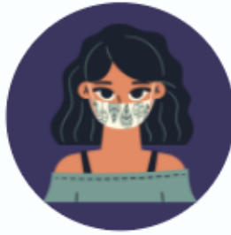
Face Covering/ Mask